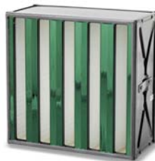
3. Sofilair H13