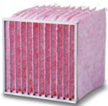
1. Hi-Flo F7