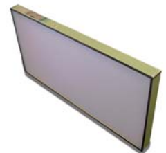
10. Megalam Green