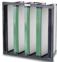
2. Opakfil Green F7