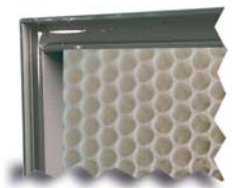
5. Megalam T "U"