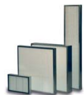
15. Ecopleat F6

Knowsley Road, Haslingden, Lancashire, BB4 4EG Tel: +44 (0) 1706 238000, Fax: +44 (0) 1706 226736 www.camfilfarr.co.uk