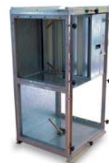
14. FC - Filter Casing