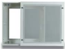
11. Softdistri Exhaust